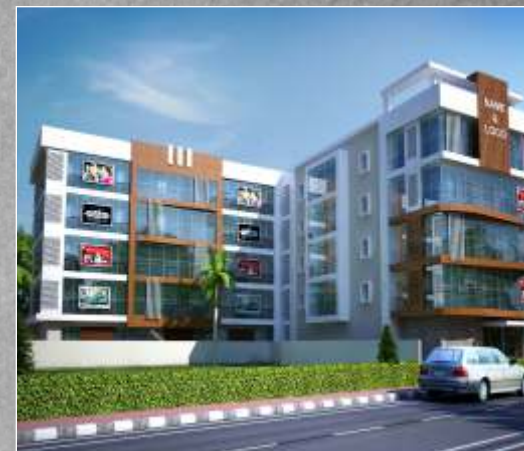
SHAVITRY TOWER, BHAGALPUR