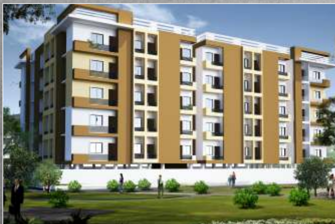
JADISH NIKETAN, BHAGALPUR