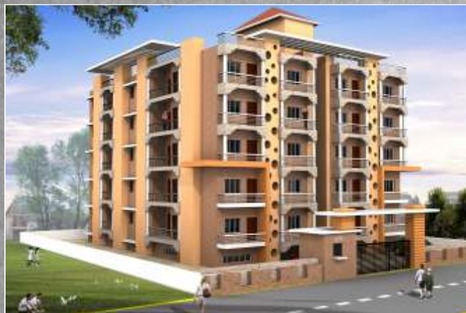
SHYAMRI TOWER, BHAGALPUR