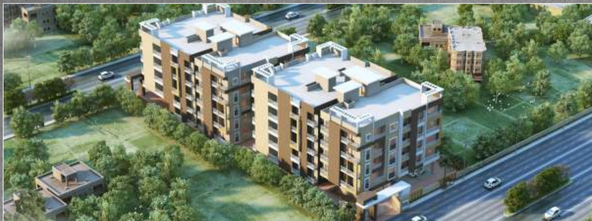
ANNAPURNA HEIGHTS, DEOGHAR