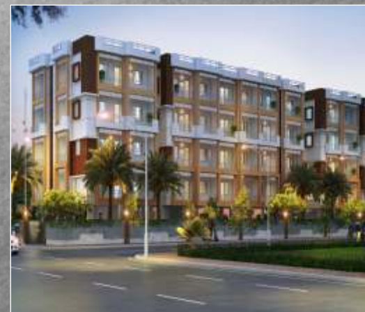
SHIVALAYA TOWER, DEOGHAR