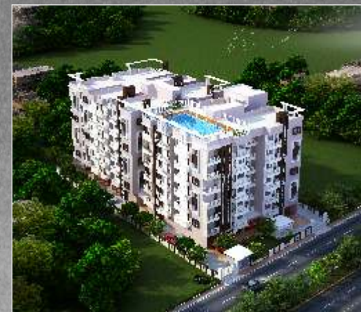
GANESH ENCLAVE, BHAGALPUR