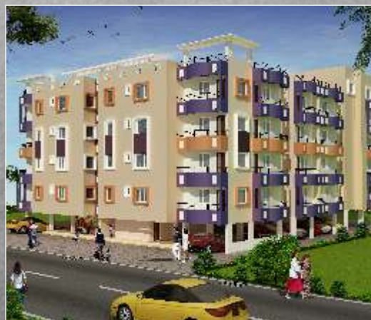
DEVPREET VIKRAMSHILA, DEOGHAR