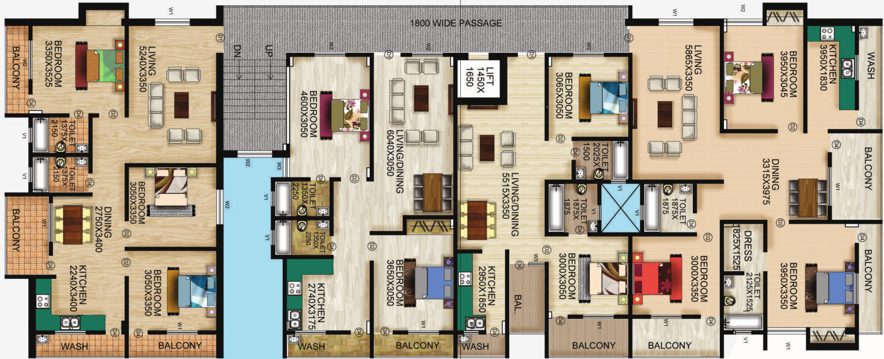
Typical floor plan