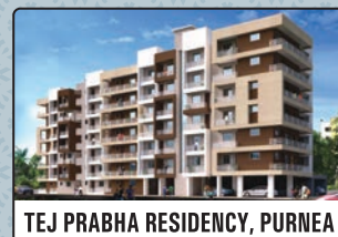
TEJ PRABHA RESIDENCY, PURNEA